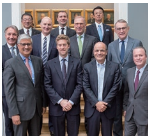
Meeting with CEOs of IARD-affiliated manufacturers (2017)

In addition, in each business area, we are complying with voluntary industry codes for the advertising and promotion of alcoholic beverages and conducting educational activities on responsible alcohol consumption. In Japan, an industry-wide movement is being advanced in coordination with government agencies and healthcare professionals under the Basic Plan for Promotion of Measures against Alcohol-related Harm.